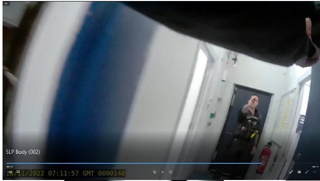
Chest mounted camera with sidearm drawn