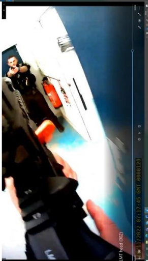
Head mounted camera with carbine drawn