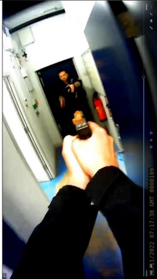
Head mounted camera with sidearm drawn